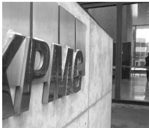
Attorneys & Accountants

M&A advisors and business brokers are attracted by our expertise and commitment at the beginning of their engagements to provide their clients an independent, third party conclusion of fair market value. The purpose of this valuation is to close the gap between buyer and seller expectations and increase the probabilities to close a deal successfully and saving a tremendous amount of time.